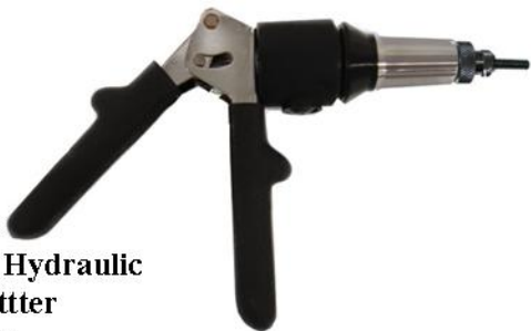
D-100 Hand Hydraulic Nutsetter Riveter

The D-100 Hand Hydraulic Nutsetter supplied in the D-100-RN kit provides up to 3,750 lbs of pulling force over a .625" stroke. In the event there are limited access areas where the larger air operated tool will not fit, or if compressed air is unavailable, the sheet metal technician has the capability to perform needed installations.