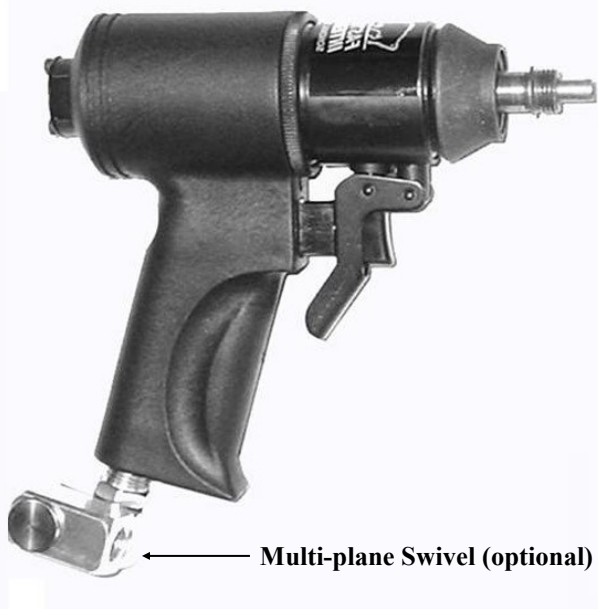
Multi-plane Swivel (optional)