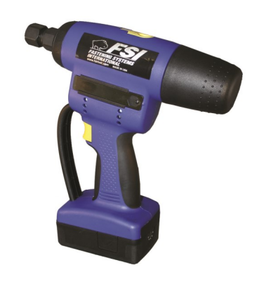
PT-4500H standard configuration for Huck 2025 style pulling heads