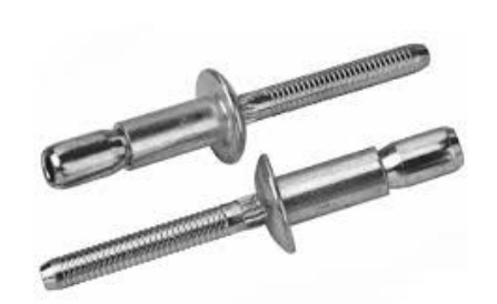
Magna-Lok® & Interlock®