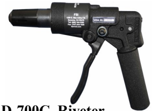
D-700C Riveter-Nutsetter Pull Force: 5,000 lbs. Stroke: .800"