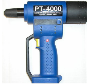
PT-4000 Riveter Pull Force: 4,496 lbs. Stroke: .787"