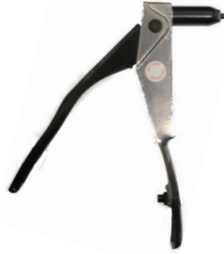
D-28 Riveter Hand Mechanical