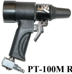
PT-100M Riveter Pull Force: 4,000 lbs Stroke: .625"