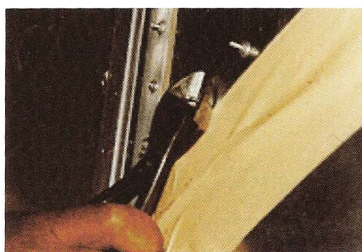
1. PROTRUDING MANDREL IS SNIPPED FLUSH WITH RIVET'S HEAD.