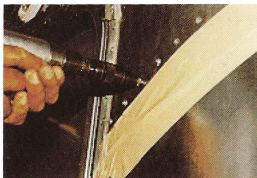
2. PROPER SIZED SHAVER TOOL, INSTALLED IN A STANDARD 1/4" DRILL, SHAVES RIVET HEAD.