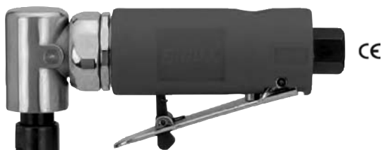
Heavy Duty Right Angle Die Grinder