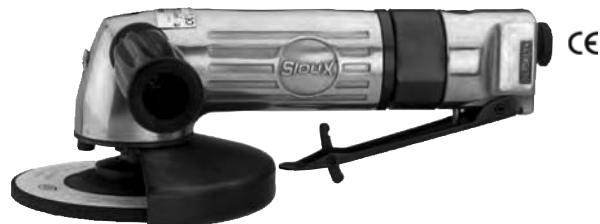
5" (127 mm) Right Angle Heavy Duty Grinder