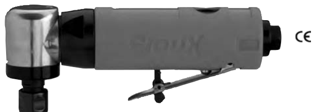
Right Angle Light Duty Die Grinder